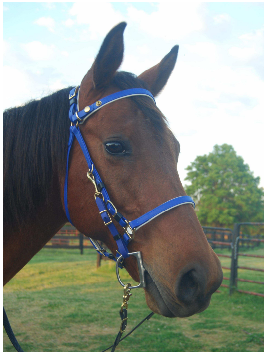
Beta Blue 522/White 520