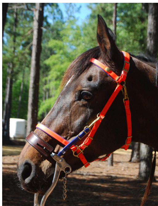
Beta Orange 520/Blue 522

Price list at back of this catalog. Updated price lists available periodically online. Online prices will always be current.