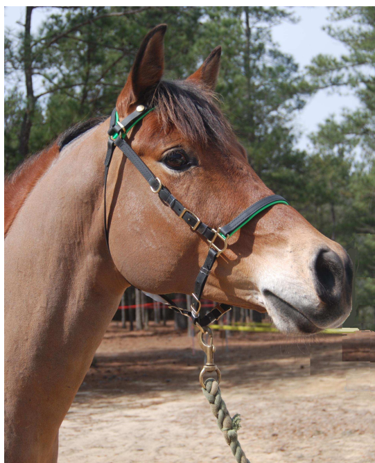
Beta Black 520/Green 528

Convertible: Make into an "endurance bridle" by removing the browband. Make into a headstall by removing the noseband, bit-hangers and chin connectors. Your bit or hackamore will easily connect to the side cheek straps. Make into a "Quick Bridle" by adding an extra completely adjustable crown. (See Quick Bridles)