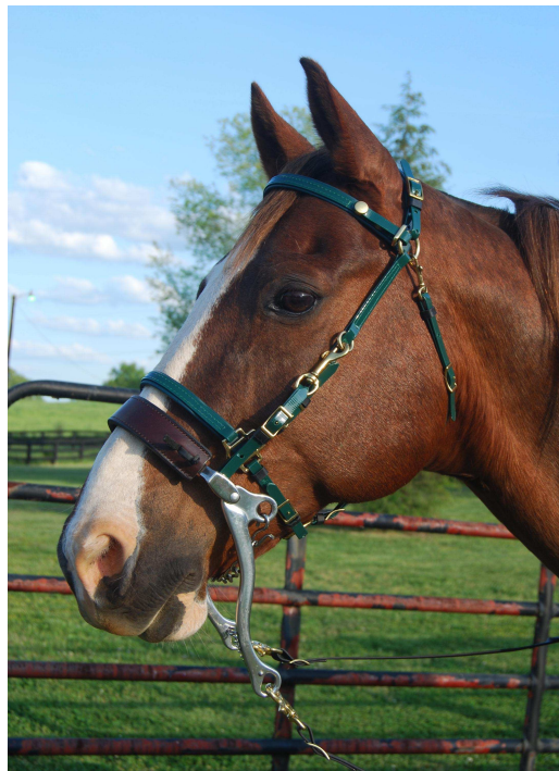
Green 103/Green 521

Noseband: Unless you really need/want to crosstie your horse, we really do not recommend this style. The side halter squares can rub the cheeks bones - especially on short- headed horses - and can interfere with the proper action of a hackamore.